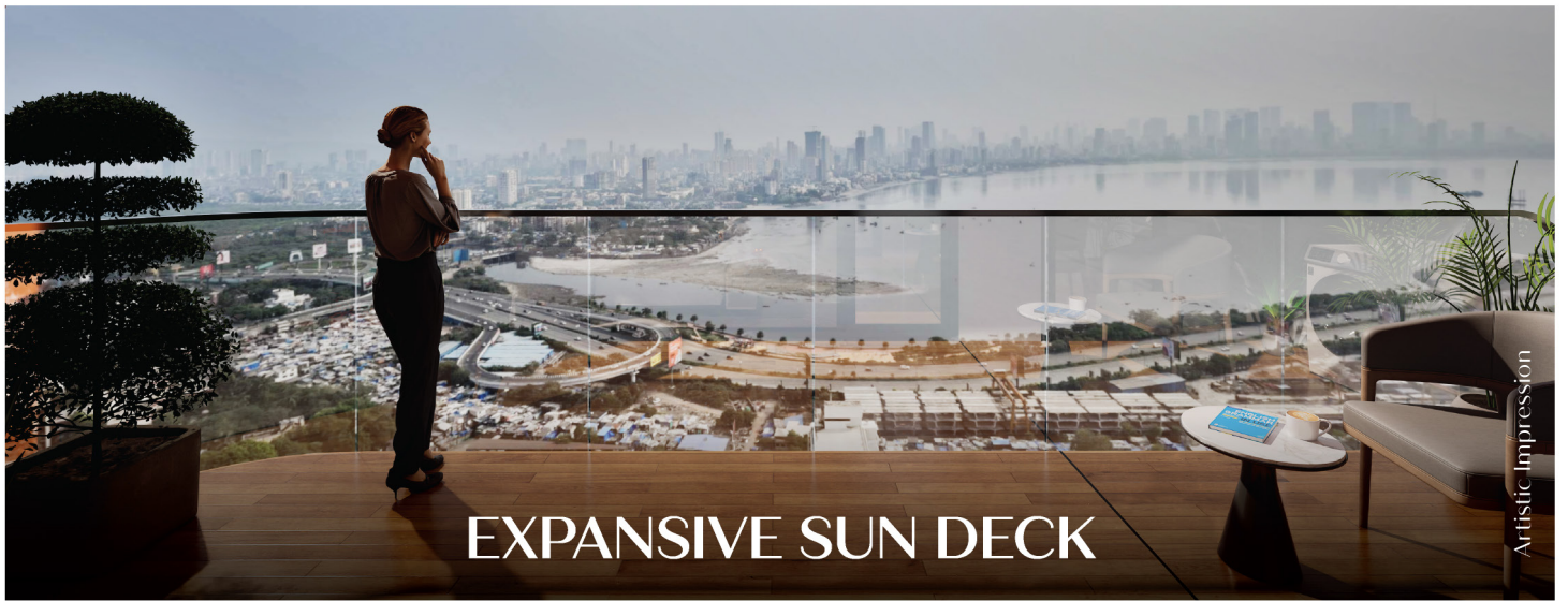
EXPANSIVE SUN DECK