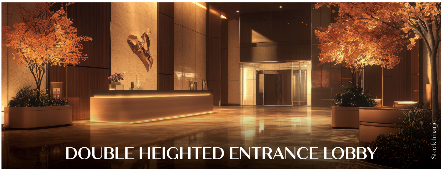
DOUBLE HEIGHTED ENTRANCE LOBBY